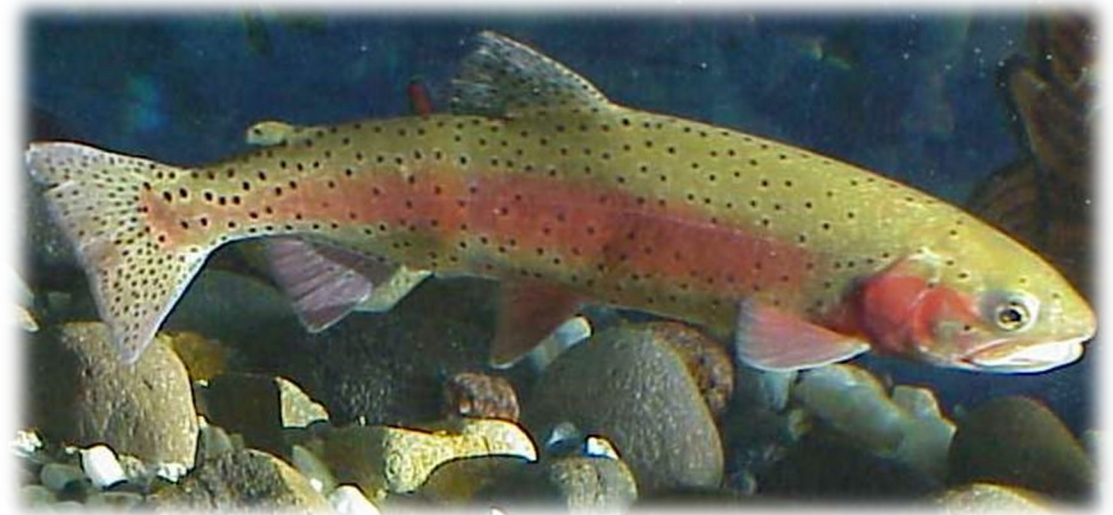
Lahontan Cutthroat Trout